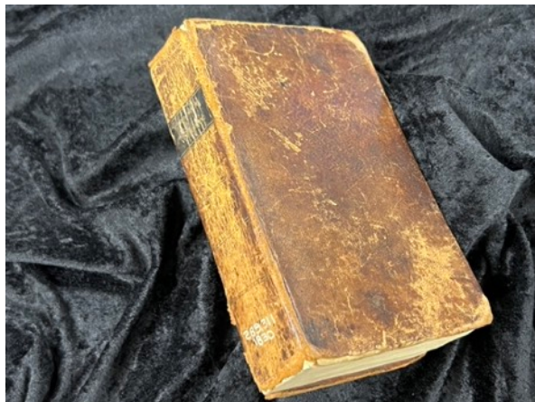
Book of Mormon Census