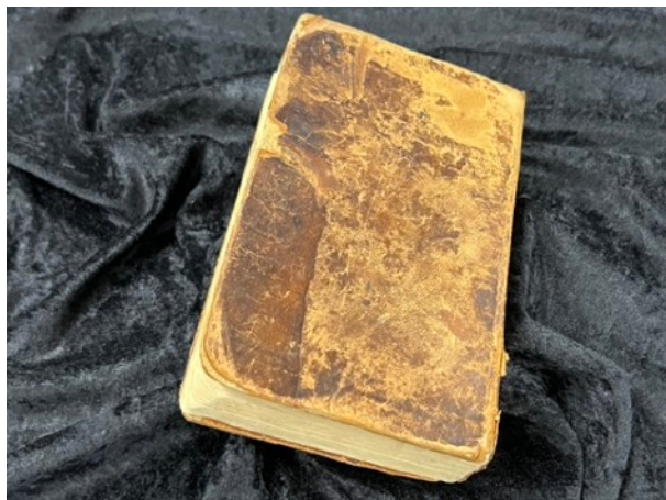
Book of Mormon Census